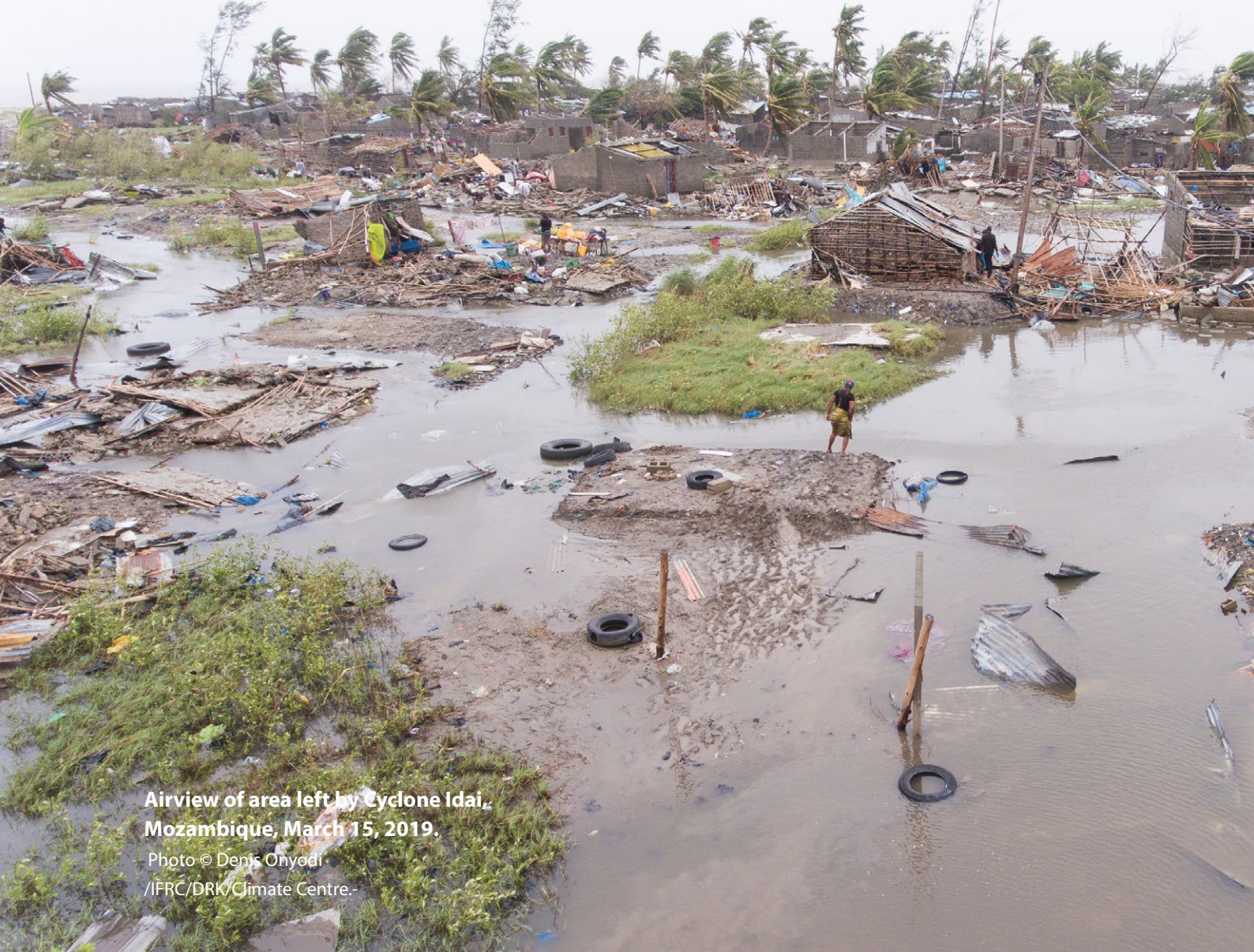
Airview of area left by Cyclone Idai, Mozambique, March 15, 2019.