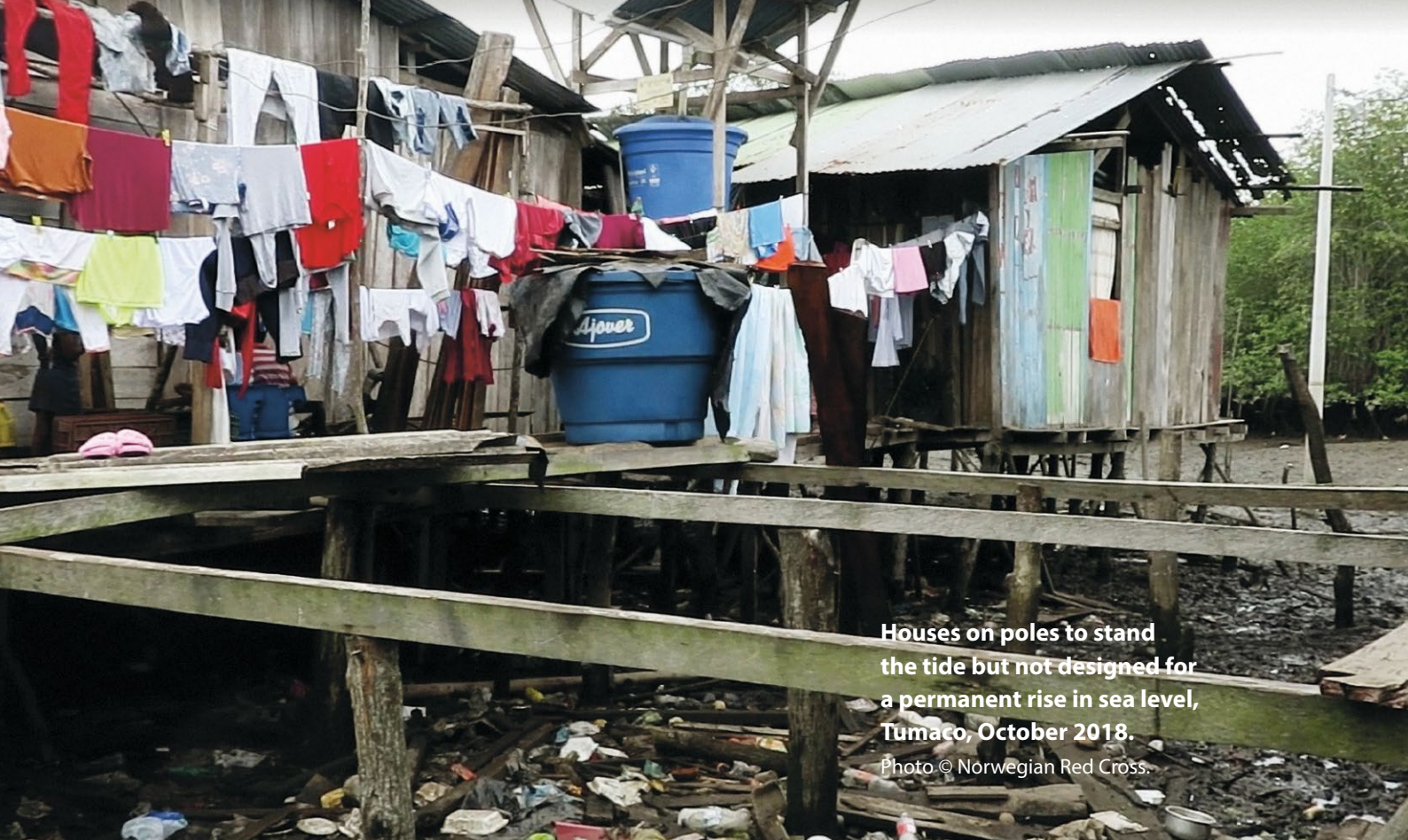
Houses on poles to stand the tide but not designed for a permanent rise in sea level, Tumaco, October 2018.